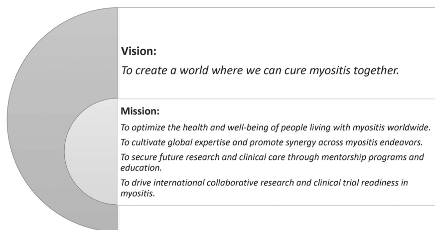
Fig. 1. The vision and mission of MIHRA.